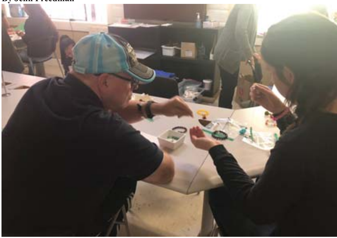
Students help each other make beaded bracelets.

he local nonprofit Mindful Littles brought together 10 disabled adults from Las Trampas School in Lafayette and 22 students from Carondolet High School in Concord Oct. 10 to create mindful crafts, like beaded bracelets, lavender sachets, and painted pots, which will be sold at a Peace and Kindness Carnival on Veterans Day at Orinda Community Park.